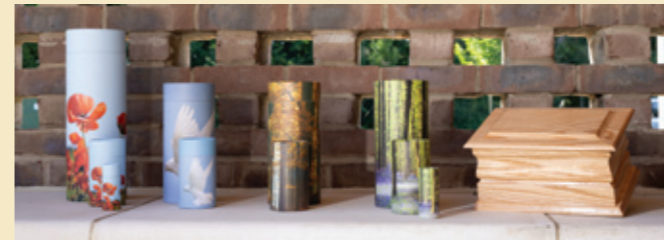
Scatter Tubes & Casket