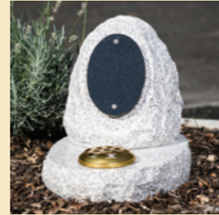
Ailsa Craig Boulder

We offer a range of natural long lasting granite memorials to commemorate your loved ones. We have various Urns, Scatter Tubes and Caskets available. All our memorial options can be purchased through the Oak Hill Bereavement Team.