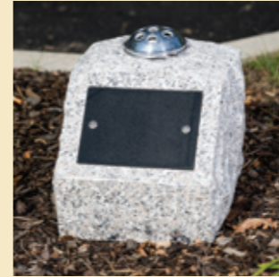
Pitched Granite Boulder